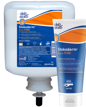
Specific Application - Water-based Substances