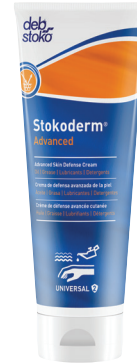
General Purpose - Heavy Exposure