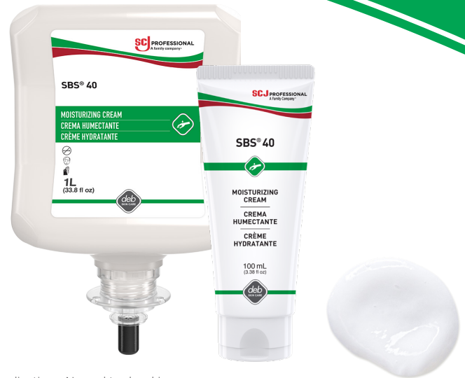
Application - Normal to dry skin

After-work skin restore creams help to maintain the skin in healthy condition by keeping it strong and supple, avoiding dryness. Using restore creams is an important element in skin care best practice.